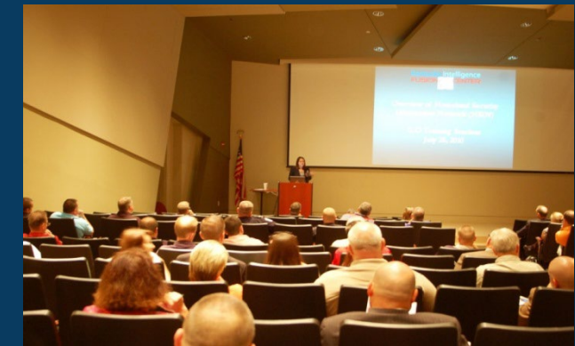
Fusion Center Training