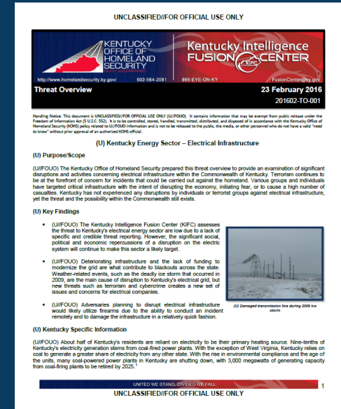
Fusion Center Threat Reporting